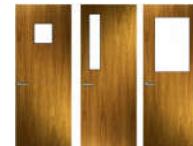
GLASS LITES See Elevations See Lite Kit Options