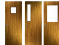
GLASS LITES See Elevations See Lite Kit Options