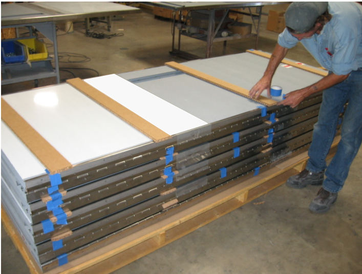
The last phase of our rigid quality control program occurs during packaging to guard against defects or shortages.

We carefully monitor all shipments to insure your delivery is on time and delivered free of defects or shortages.