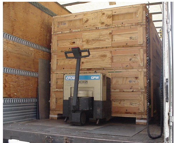
All boxes, skids, crates, and palettes are individually designed and constructed for specific products