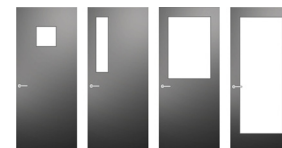
GLASS LITES See Door Elevations See Lite Kit Options